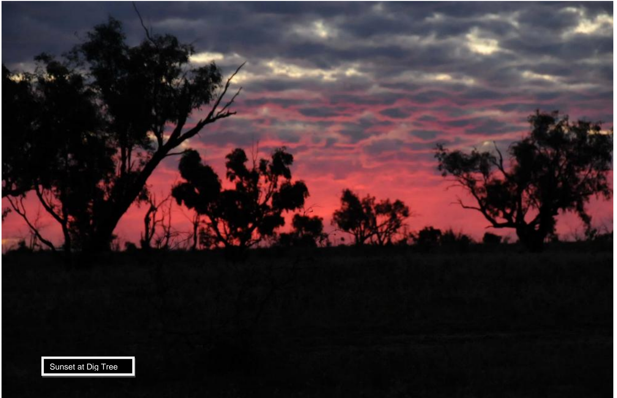
Sunset at Dig Tree