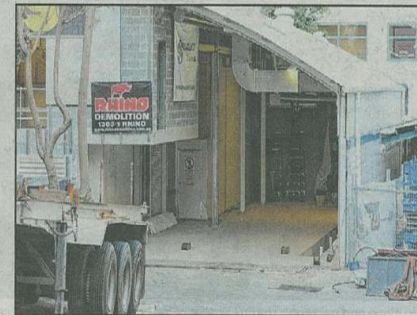
Breath in: The largest hyperbaric chamber, above, being installed

The chamber will allow the hospital to treat 28 patients, while the existing 40-year-old one can only treat eight. The new chamber is completely electronic and closely resembles a modern hospital ward.