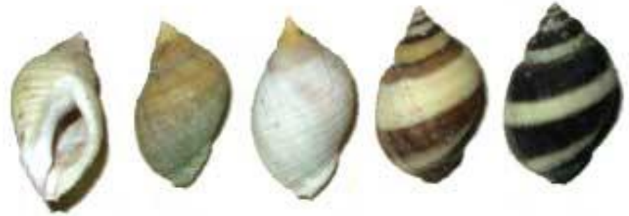
Dog Whelk Shells

After taking a few pictures of this critter I noticed that I was diving solo, anyhow it was time to head back as I was getting a bit cool.