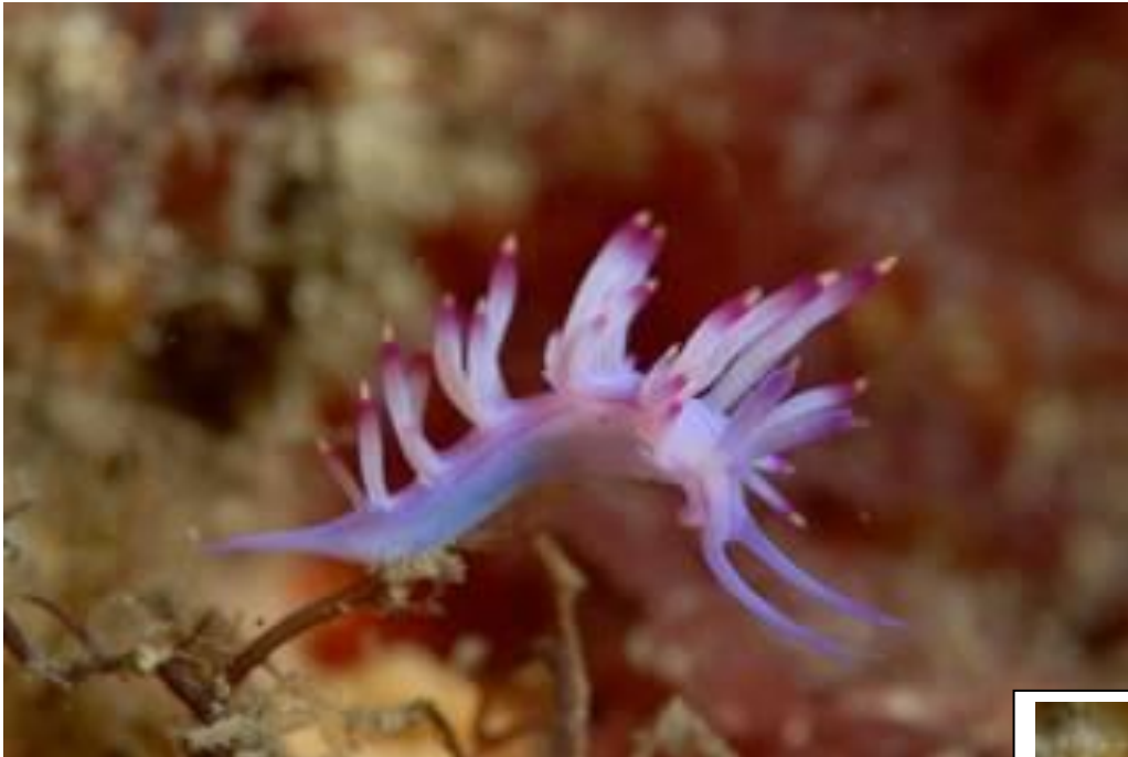
Four nice shots