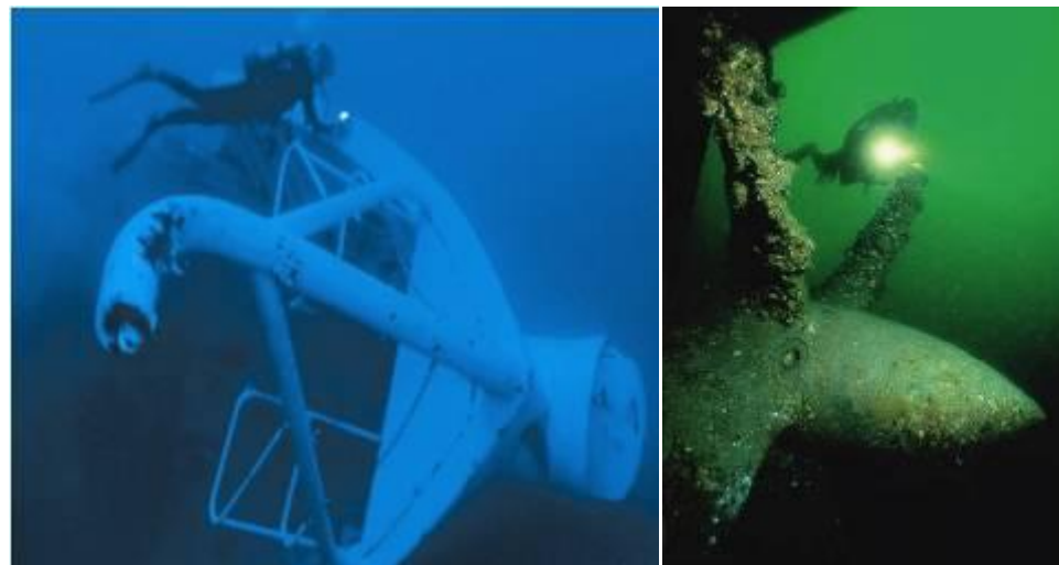
The ex-HMNZS Tui and ex-HMNZS Waikato were sunk in 1999 and 2000 respectively. The Waikato rests upright at 29 metres, and the Tui sits at 32 metres.

Dive the Poor Knights Islands, the HMNZS Tui and HMNZS Waikato wrecks from Tutukaka for four days. Water temperature expected to be 19-22° in March. Stay at either the Tutukaka Holiday Park in self-contained cabins or at the Oceans Resort, both a short walk from the Dive Shop, Marina and Restaurants.