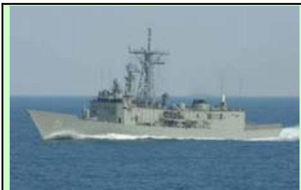
HMAS Adelaide Statistics:

Editors note: The NSW Government have previously committed the Frigate to Terrigal on the Central Coast.