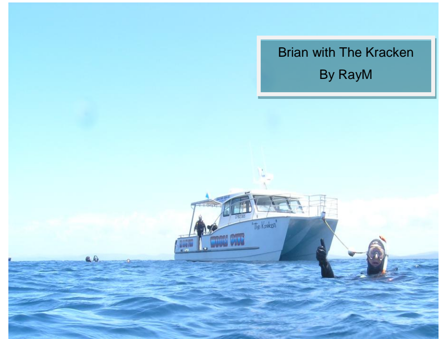
Brian with The Kracken By RayM

7 Days of diving, 12 Divers, we were all feeling positive and looking forward to a week of awesome diving