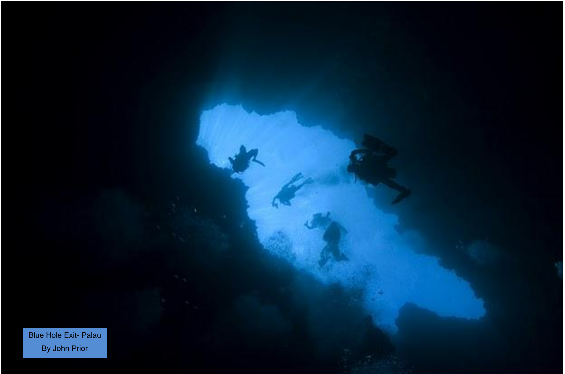
Blue Hole Exit- Palau