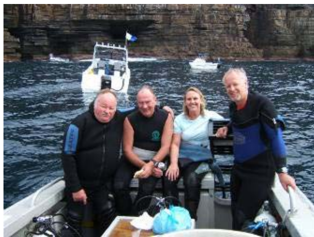
Other recent shots from our Jervis Bay Easter Club Weekend Away Dives.