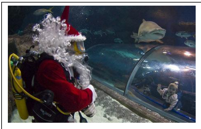
Diving with a Christmas feel.