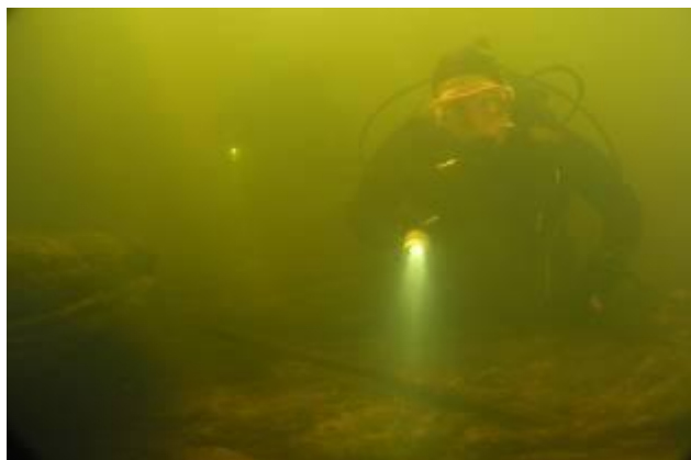
Kelly looking for critters in the lagoon.

Later on around the campfire, there was some discussion about whether they were shrimp or yabbies. I could not see any nippers so I'm calling them freshwater shrimp, especially since I'm writing this article!