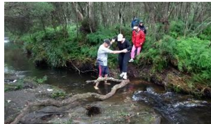
Divers don't like getting their feet wet!

The next challenge was to organise dinner. I realised that I brought the gas bottle for my BBQ – this was good.