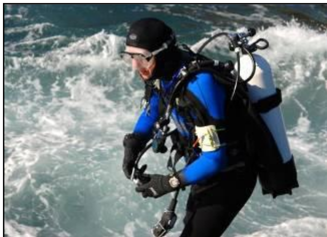
Entry point washing machine

Conversation was difficult though as the local vintage motorcycle club was using the car park as the starting point for one of their rallies. Needless to say there was a lot of engine revving and “Grecian 2000” around.