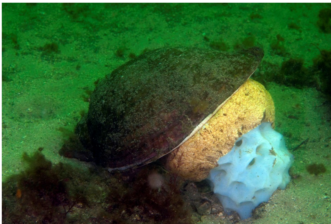
Magnificent Volute laying eggs