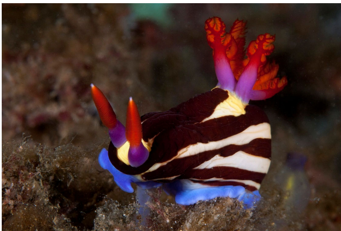
Purple Lined Nembrotha