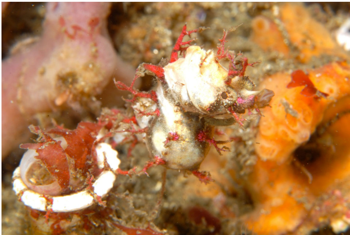
photo of Pygmy Pipe Horse

A big thankyou to members for sending in articles: