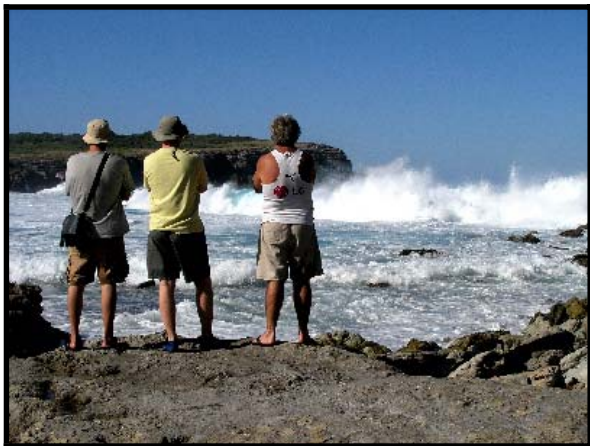
Watching the seas at the south end of Bowen Island – and dreaming what might have been!

Halfway into our return, Les Cat slowed and began to drag heavily; it seemed that the impact of the seas had affected the welds on the hull letting in water. After a few nervous moments we arrived safely back at the ramp.