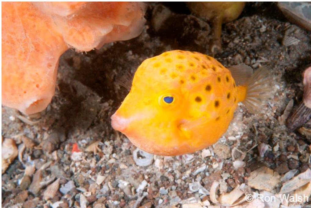
Juvenile Smooth Boxfish

Despite the rain, everyone had an excellent time.