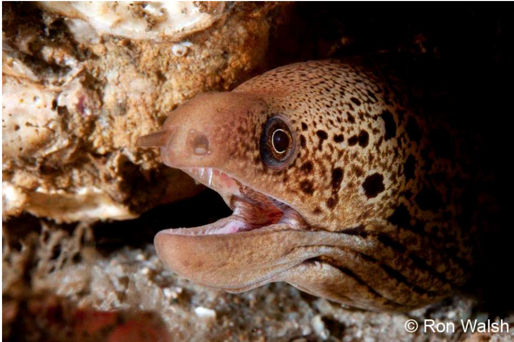
Sieve pattern moray