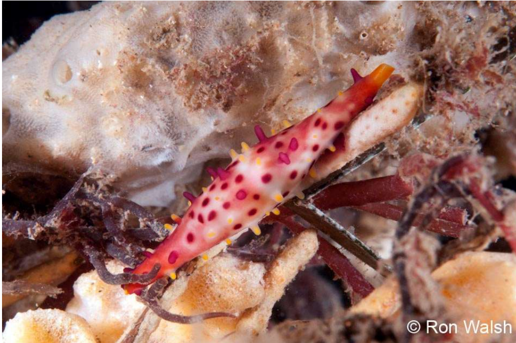
Rosy Spindle Cowrie