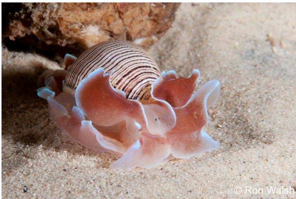
Rose Petal Bubble