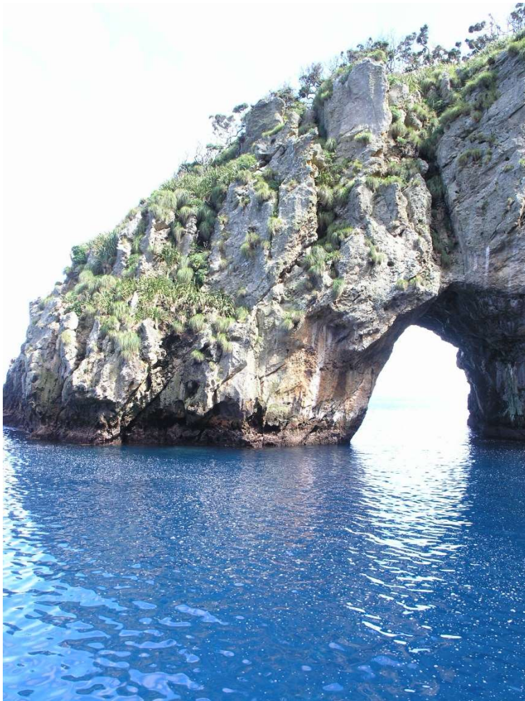
Middle Arch, Poor Knights.