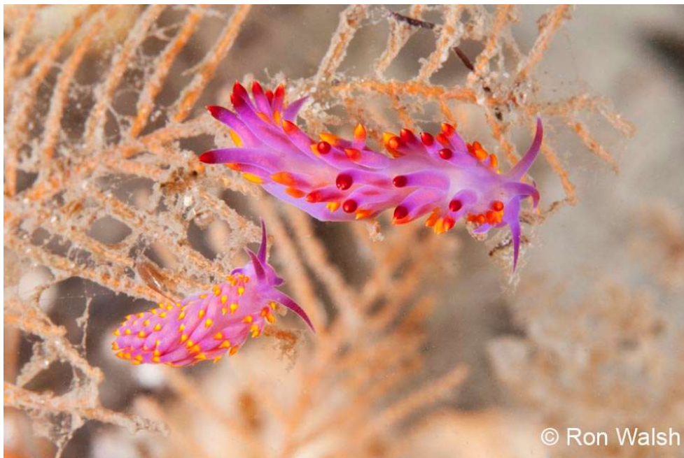
Trinchisia Sibogae (by 2)