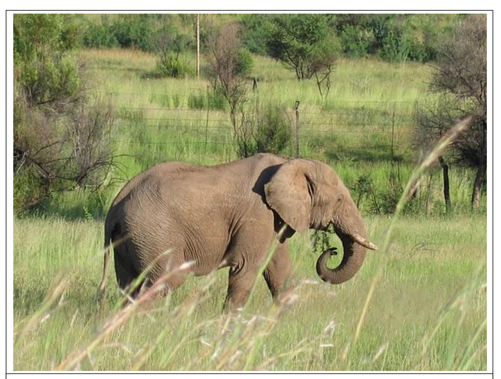
From Gary Perkins recent trip to South Africa Not all good shots are taken underwater and next page also