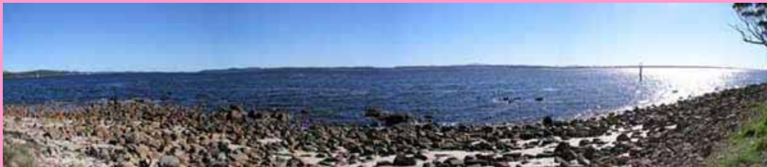
Halifax Park Dive Site

Diving will be at Halifax Park, Fly Point or The Pipeline, at high tide.