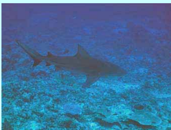
Bull Shark (Carcharhinus leucas)

And Kelly has it on the calendar for next October, it's a big trip - big things with even bigger teeth!