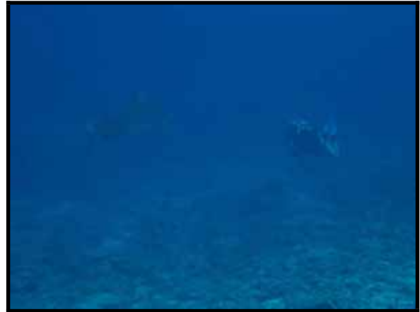
Pete meets the Bull Shark

The shark realized he was coming and went out to meet him. By this time Pete was coasting with the current while the shark swam effortlessly against it. They were playing chicken and it didn't seem as though Pete's teeth were big enough.