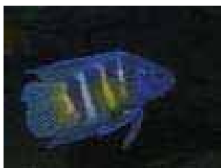
Blue Devil Fish

it does the job a treat and sitting on the gunnels is really comfy in a choppy sea.