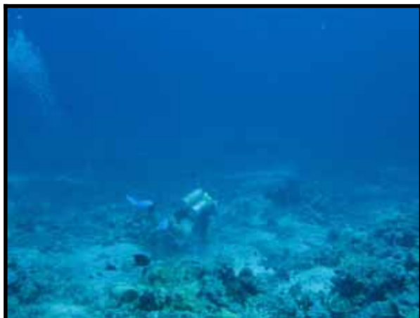
Pete still chasing the Bull Shark

Given that there is a growing awareness of what we are doing to the environment and that sharks are the top of the food chain I got a huge amount of enjoyment from some the talks from the marine biologist and satisfaction from what my money was supporting.